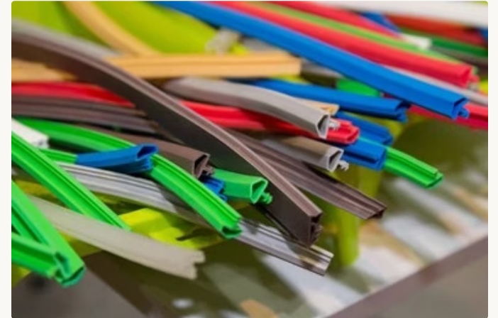
Extruded Rubber Gaskets

Continuous profile gaskets for various industries